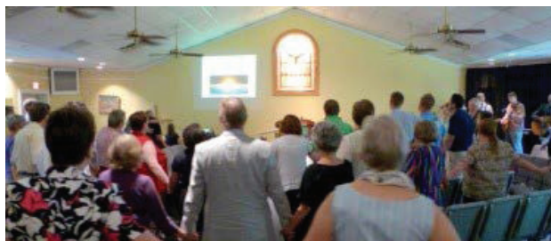
UU Congregation of Gwinnett in worship

The UU Congregation of Gwinnett (UUCG) seeks Chalice Lighter funding assistance for their recent hire of their first compensated Choir Director. The congregation is committed to creating a high quality music program under the direction of a professional choir director and sees this as essential to growing their worship program to be the vibrant, multigenerational gathering space they dream of.