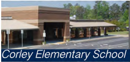
Corley Elementary School