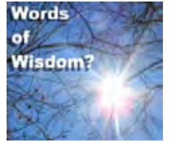
Words of Wisdom?