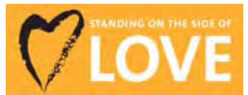
STANDING ON THE SIDE OF LOVE