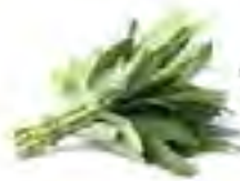
SAGE Serving Aging with Grace and Intention