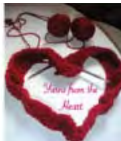
Hearts from the Heart