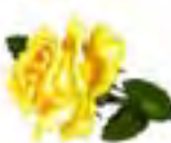
Coming of Age