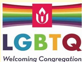
Plate contributions are shared equally with Beyond the Ribbon