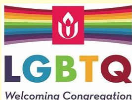
Plate contributions are shared equally with Beyond the Ribbon